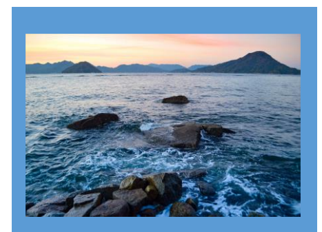
View from conference hotel

Join the International Behavioral Neuroscience Society for the 26th Annual Meeting on June 26-30, 2017. Hear from the best in our various fields of study, network with scientists and researchers from all over the world, present your work and visit Hiroshima, Japan, a vibrant city with a rich culture.